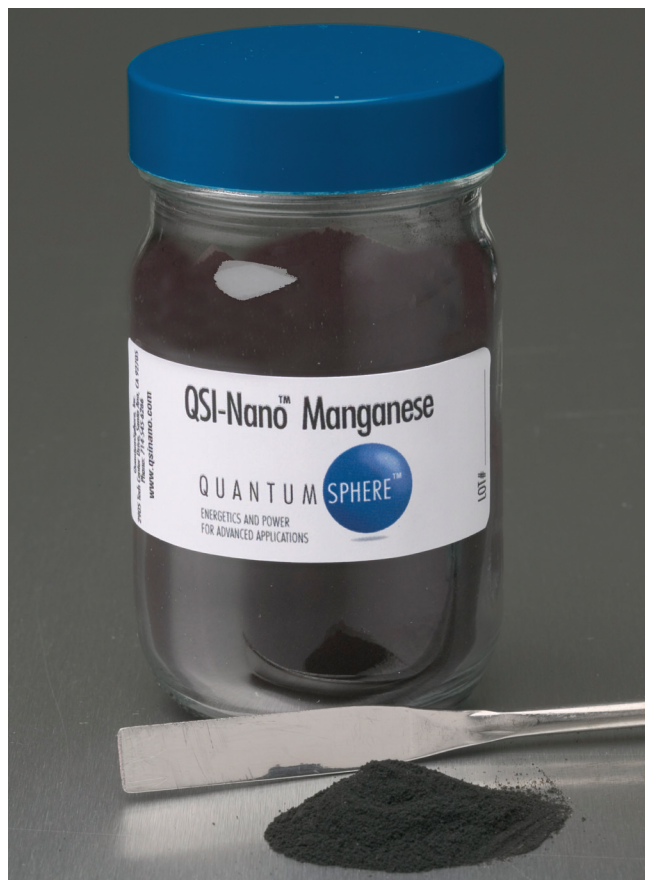
QSI-Nano® manganese powder

Call 714-545-NANO (6266) to speak with a product specialist or visit us online at www.qsinano.com .